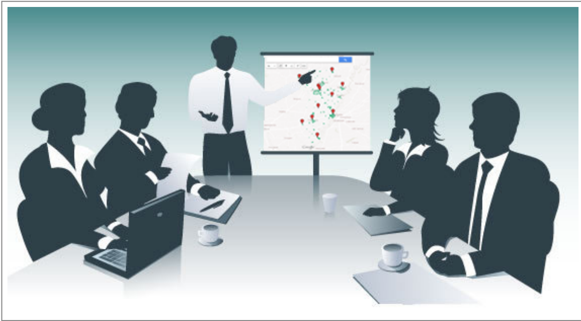
Be supportive throughout the meeting

As the event organizer and regional leader, it will be imperative to provide structure and support throughout the course of the meeting and during the presentations.